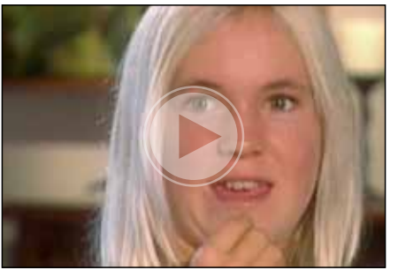
Exclusive: Bethany Hamilton