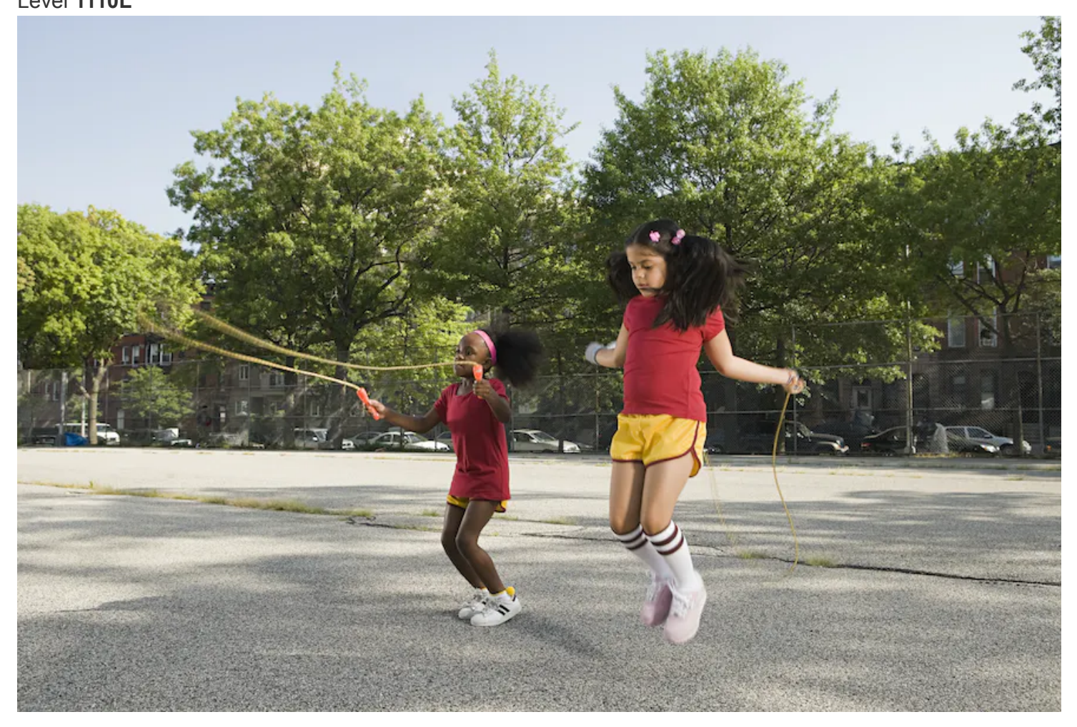
Physical factors can play a role in a person's health. Natural environments such as parks and gardens, as well as built environments such as buildings, roads, worksites and schools, can influence a person's health.

By Public Domain, adapted by Newsela staff on 09.01.20 Word Count 661 Level 1110 L